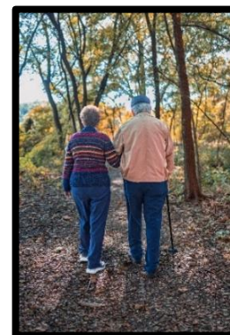
[proposed cover picture]

The book is now at the publisher. We look forward to sharing our story—a story of walking through God's open doors. The book should be available early next year.