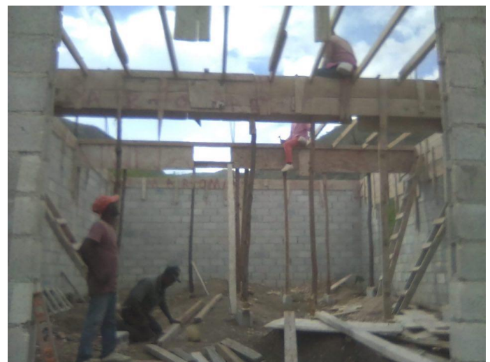
Left, some church members at the construction site with evangelist Maché (with tie). Right, the roof will soon be poured.

Some commitments from donors and churches have not yet been received. The Fort Gibson (OK) church has generously provided funding that will finalize the project, assuming the receipt of existing commitments (and with the possible exception of some inflationary increase in cost).